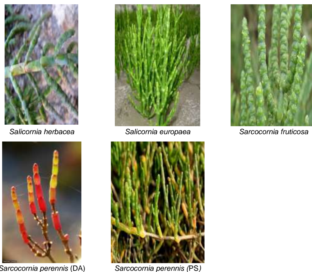
Fig. 1. Plant materials of Sarcocornia sp. and Salicornia sp. used in the study.