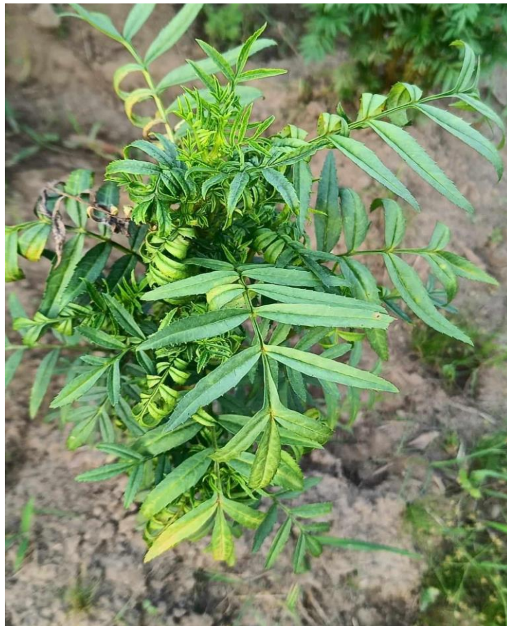
Fig 3. Leaf curling symptoms of Tagetes erecta L.