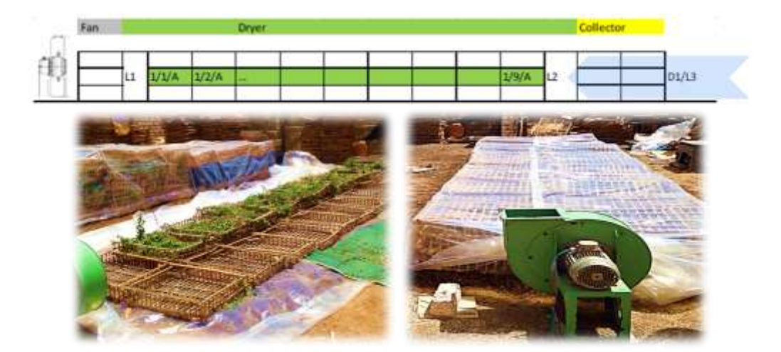
Fig 2. 1/9/2 design of solar-assisted stack dryer (Design 2)