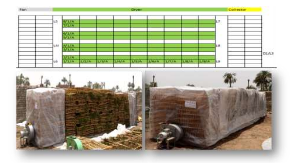
Fig 4. 8/9/2 design of solar-assisted stack dryer (Design 4)

AUJASCI, Arab Univ. J. Agric. Sci., 29(1), 2021